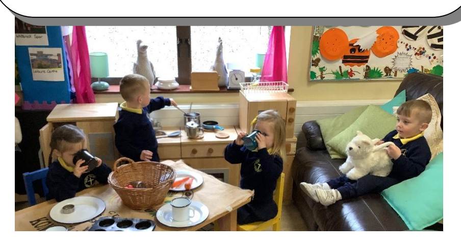
"Happy at play, learning all day"

This is our home corner. The boys and girls really like to play in here because it is like a real house with a cooker, a table, a telephone and lots of pots and pans. Sometimes we change the home corner into a shop, a hospital, a witches den or even a vets depending on our topic.