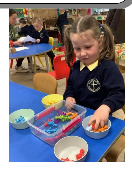
"Happy at play, learning all day"